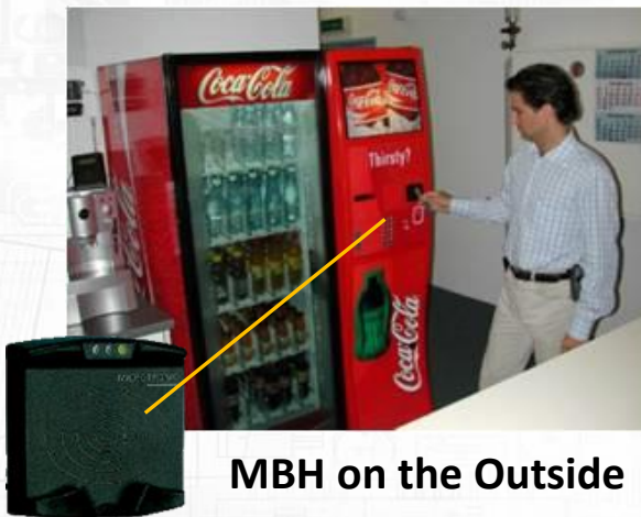
MBH on the Outside