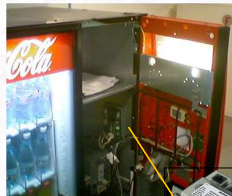
MICROpay6 on the Inside MDB