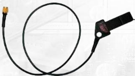
NFC / Cable HF