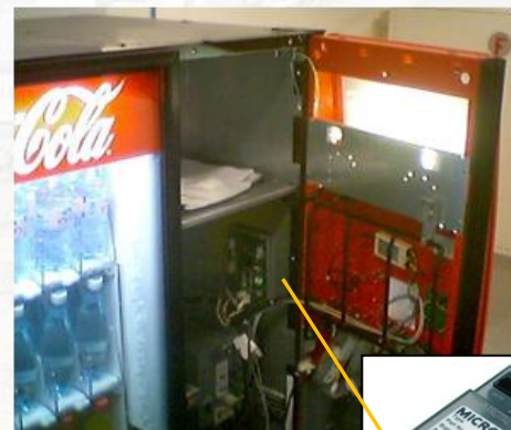
Msmart6 on the Inside MDB