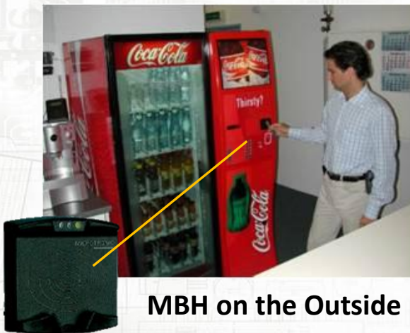
MBH on the Outside