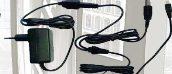
Power supply USB cables