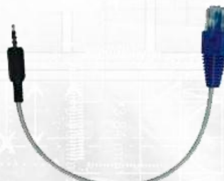
MDS / Cable Stereo Jack