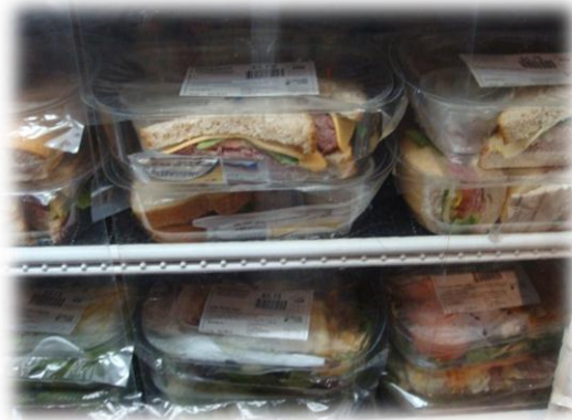
❖ Reach-in Coolers