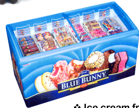
❖ Ice cream freezers

Items that won't fit in a vending machine